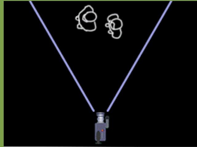
Normal vista and medium angle lens