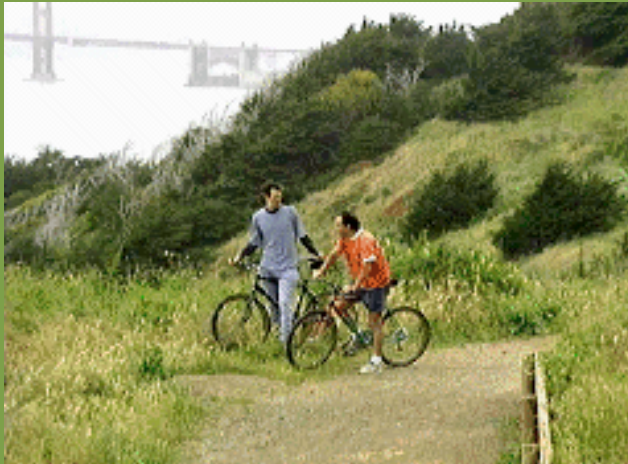
Similar as seeing something with the naked eye